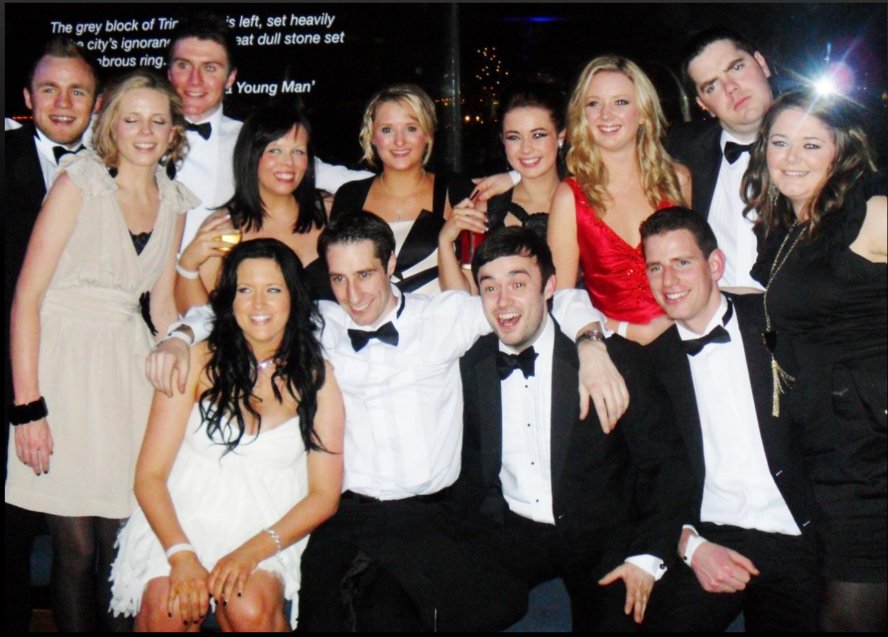
Others glamorous black-tie ball at Clontarf Castle, the City West Hotel and Fitzpatrick's Castle Hotel to name a few.